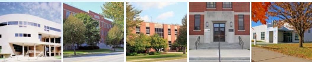
TASF Spedding Hall Metals Development Wilhelm Hall Sensitive Instrument Facility