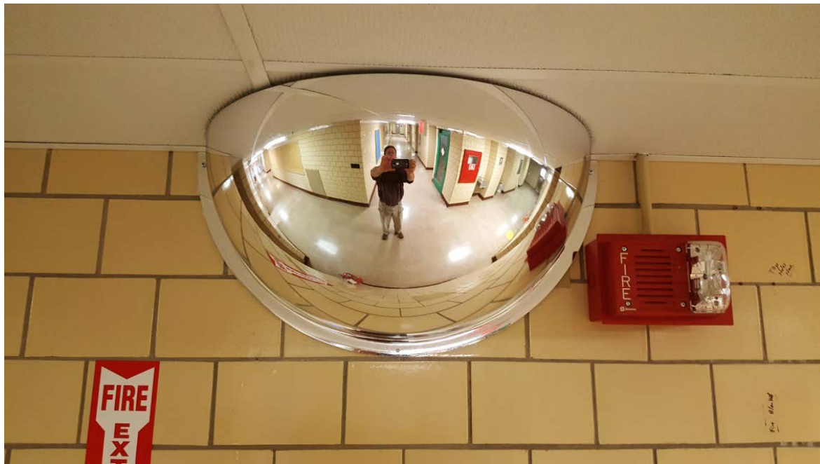
Mirrors were added at hallway junctions to improve pedestrian safety.